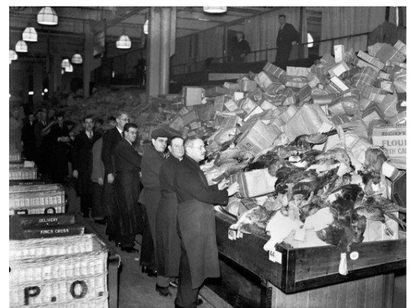
Mount Pleasant Parcel Sorting Office London