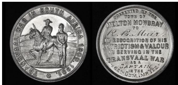
Melton Mowbray Tribute Medal

(See Bulletin Issue No 9 February 2024 for more information on these local medals.)