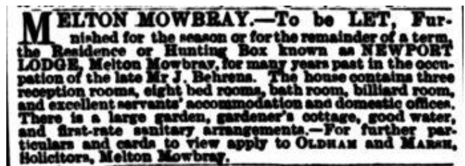
Advert from The Field, The Country Gentleman's Newspaper 29 Dec 1888